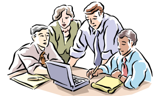
"COLLABORATION"-the theme for TRAAC Conference 2005

Our annual conference will be taking place March 4th and 5th, 2005. The theme for this year is "Collaboration". Our presenters will be offering a variety of topics including TR and Pediatric, Music Therapy, Internship Placements, Drug Rehabilitation, and Research and Theory. It will take place at the Future Inns, Halifax, Lacewood Drive in Clayton Park. We do have some rooms blocked together so please book your room by February 3rd. Hotel reservations can be made by calling 1-800-244-4333.