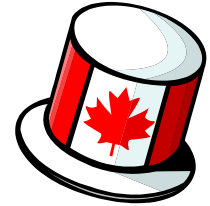
National Therapeutic Recreation Week

ATRA lists 101 ways for publicizing and promoting Recreation Therapy on their website www.atra-tr.org/101ways.htm . Please email therapeutic recreation week ideas or events that have been successful to the TRAAC website at www.traac.ca or email resources@traac.ca .